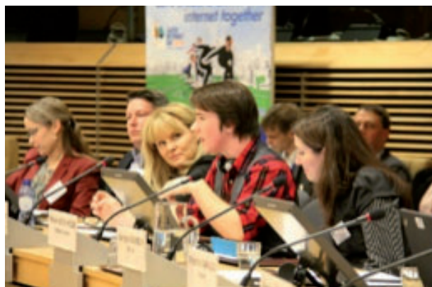
Youth around the globe take an active role in SID

Better internet can mean many things to many people, but our main aim is to foster the positive and eliminate the negative online. We can contribute to these aims in many ways, regardless of who we are. For example: