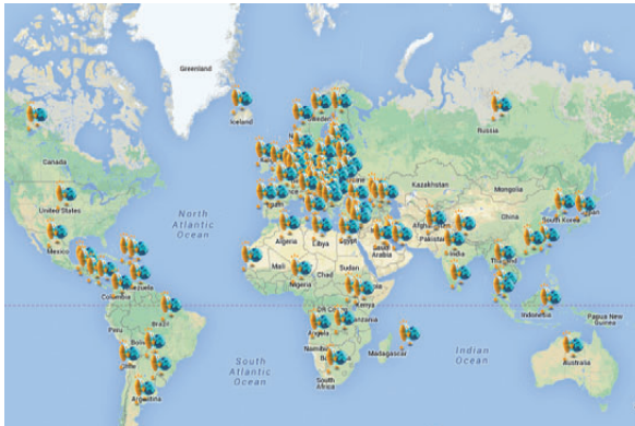
Safer Internet Day is celebrated across the globe

We hope that you will join with us, and SID supporters across the globe, on Tuesday 10 February 2015 – and beyond - so that we can all create a better internet together!