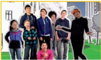
Each year, a SID video spot is developed to promote the campaign

What will you do to help create a better internet? Tell us at #SID2015 and #Up2Us.